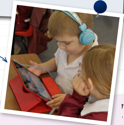
Uses a tablet to sequence steps